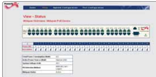
SNMP remote network management tool

Enterprise users might need to account for power usage by the different departments inside the company. Therefore consideration should be given to the ability of the PoE system to monitor power consumption of the remote devices. Also on power failure, when the UPS kicks in, the management could use a priority scheme to ensure that as the power outage continues, the power is directed to key resources. This management of failed power distribution could enable cost savings in the size of UPS needed for any given scenario. This will extend the life of the UPS support and it is a non linear function. If you halve the load on a UPS, it doesn't last twice as long, but more like 3-4 times as long. Better value and increased business continuity.