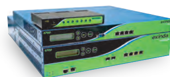
Exinda x700 WAN Optimization Platforms